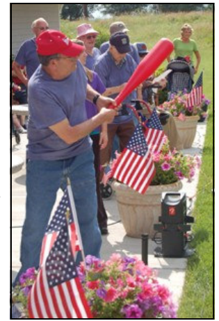
Sandi—Rock & Fire

See Stone Hearth's All-Star Line Up and more great pictures online: www.stonehearthestates.com