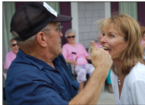
"What do you mean, I'm out!!"